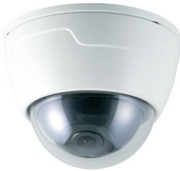
TDC-327QS2SD5 Surface Mount Type