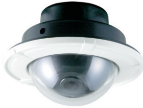
TDC-327QS2FD5 Flush Mount Type