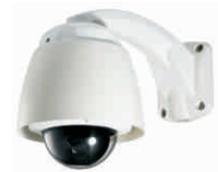
Sun Shield (MBR-300SS)