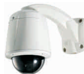
Wall Mount Bracket (MBR-300W)